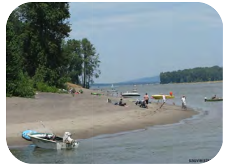
Warrior Point Beach is accessible from Reeder Road.