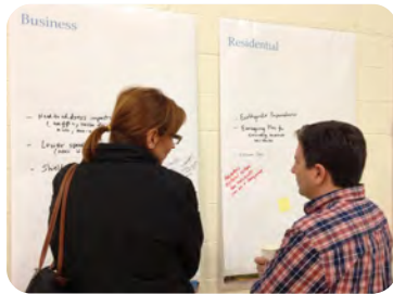
Visions were collected on the walls and questionnaires.

outlets throughout the Metro region. Additionally, information on the study was advertised through the Sauvie Island Community Association's (SICA) website and meetings.