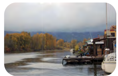
A marina during the fall.

A RAP then becomes part of the County's Comprehensive Plan, which addresses state regulations and needs to be updated periodically; the RAP should be thought of as a detailed chapter within the overall Comprehensive Plan. The Comprehensive Plan looks at transportation and land use, but also includes recreational facilities, natural resources, air and water quality, sanitation/sewer systems, and other systems for all of Multnomah County.