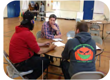
Open house attendees spoke with staff members.

Additionally, Multnomah County staff attended the Sauvie Island Community Fair and annual meeting for SICA on April 18, 2013 (Appendix J). Four questionnaires were collected at the event and staff spoke with several residents and visitors about the process.