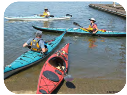
Kayakers use Sauvie Island as a launching point.