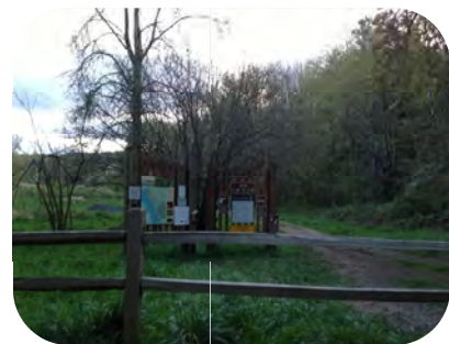
Wapato State Park was mentioned as popular destination