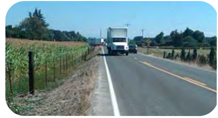
Narrow shoulders on the roads are one issue raised by all road users.

Between February and April 2013, Multnomah County conducted extensive outreach as part of the Sauvie Island/Multnomah Channel scoping process. Local residents, businesses, government agencies, community organizations, and frequent visitors were involved with this scoping process through two open houses, two printed and online questionnaires, two stakeholder meetings, and two focus group meetings. Additionally, Multnomah County staff attended the Sauvie Island Community Fair and a Sauvie Island Community Association meeting, as well as conducting a phone interview with the Grand Ronde Tribe.