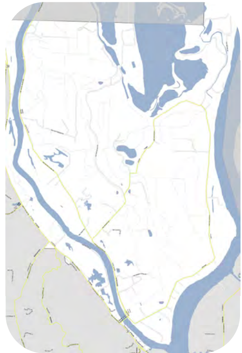
The plan area is shown in white and is surrounded by the Multnomah Channel, Columbia River, and Columbia County.

The area includes about 15,400 acres of land and several thousand additional acres of water. Approximately 11,800 of these acres are designated in the Comprehensive Plan as Exclusive Farm Use (EFU), with the remainder designated as Multiple Use Agriculture (MUA). About 1,300 people live in roughly 450 units on the island and 200 units between Multnomah Channel and Hwy 30.