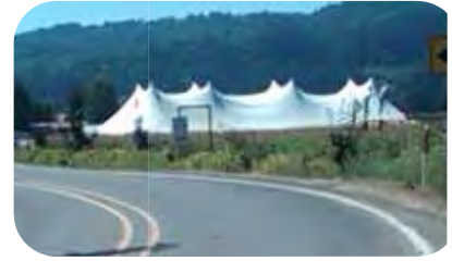
A large farm tent in a field.