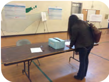
At the second open house questionnaires were collected.