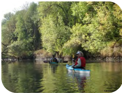
River users in the Cunningham Slough; northern Sauvie Island.

The scoping process generated a robust response from community members and stakeholders both in terms of the volume of responses received and the high level of interest and importance respondents placed on the issues and ideas they shared. Based on the number and nature of the issues raised, the high level of community interest, and the age of the existing Rural Area Plan/Transportation System Plan, this report concludes with a recommendation that Multnomah County update the Sauvie Island/Multnomah Channel Rural Area Plan and the Multnomah County Transportation System Plan. Both of these updates should build upon the work completed during this scoping process to move toward a shared vision for the community and actions for addressing the issues identified.