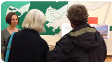
Attendees added issues to maps and spoke with staff members.

On March 5, 2013, two stakeholder meetings were held at the CH2M HILL downtown Portland offices to collect issues, questions, concerns, and visions from key stakeholders. Stakeholders were identified from their interest in the last planning process in 1997, as well as their current interactions and communication with the County. The list of invitees was extended to other stakeholders that were assumed to have strong opinions about the study (appendices A and B). Approximately 17 government agencies attended one meeting and five organizations and non-government stakeholders attended the other meeting.