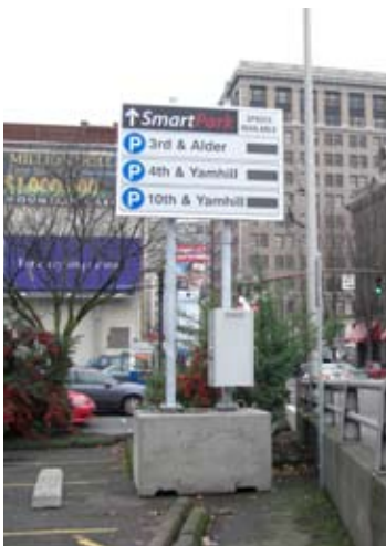
Left, photo of existing sign in place, looking west

Site address: 530 SW 2nd Avenue, Portland, Oregon 97204