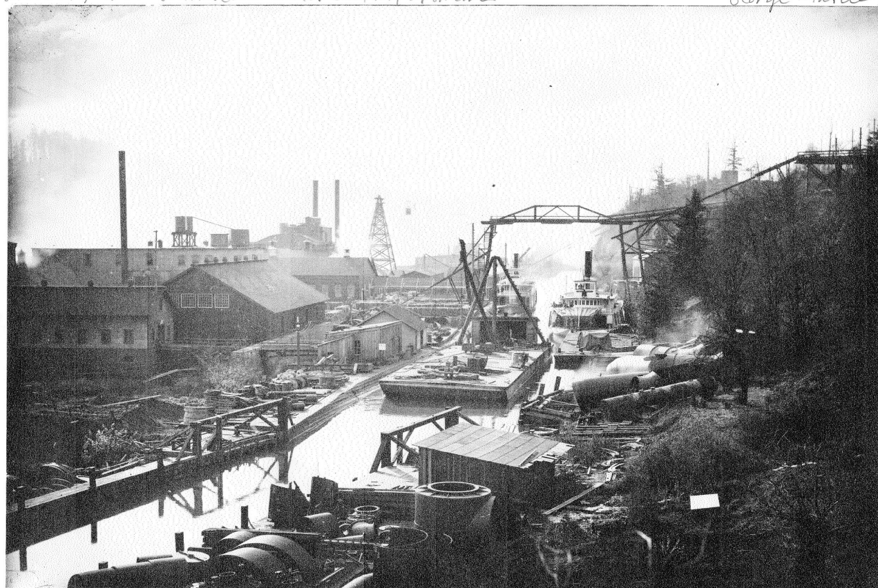
Willamette Locks, 1894.