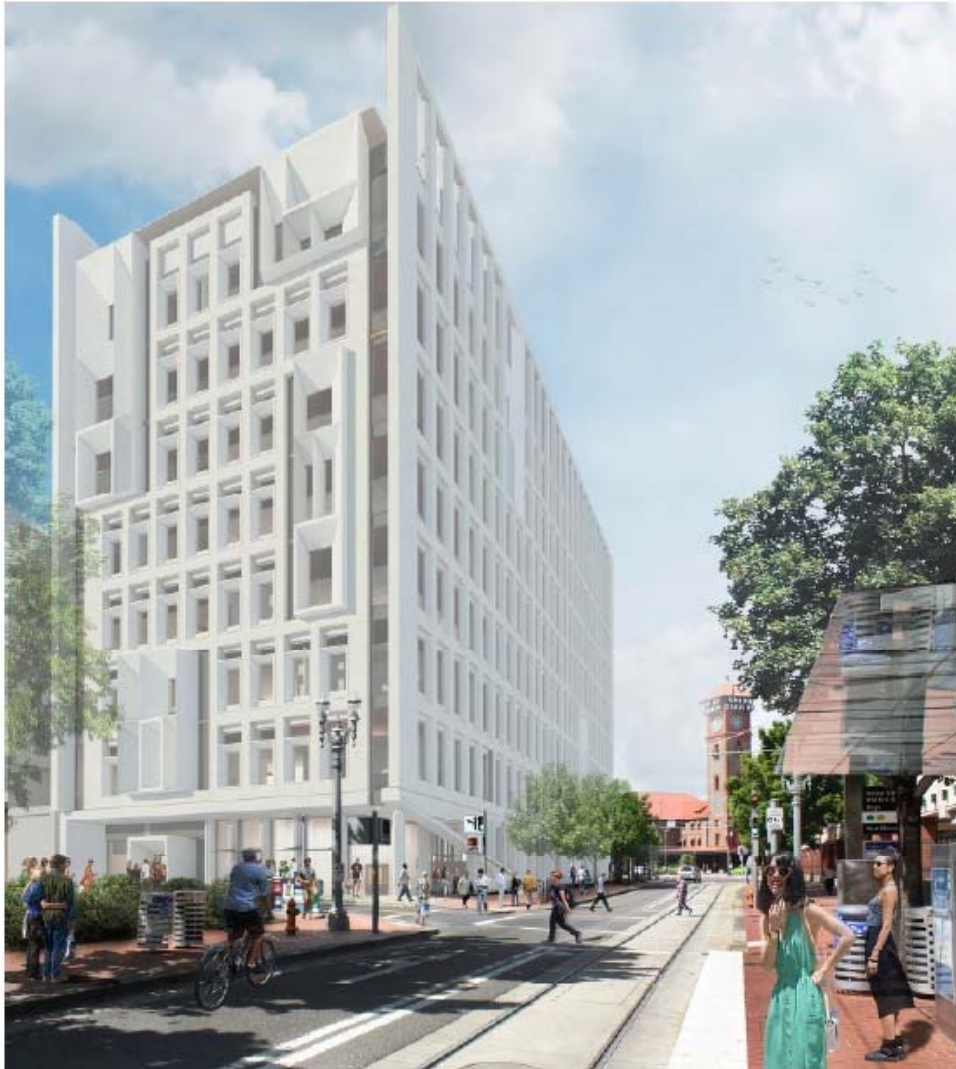
Gladys McCoy Building from 6 th Ave.