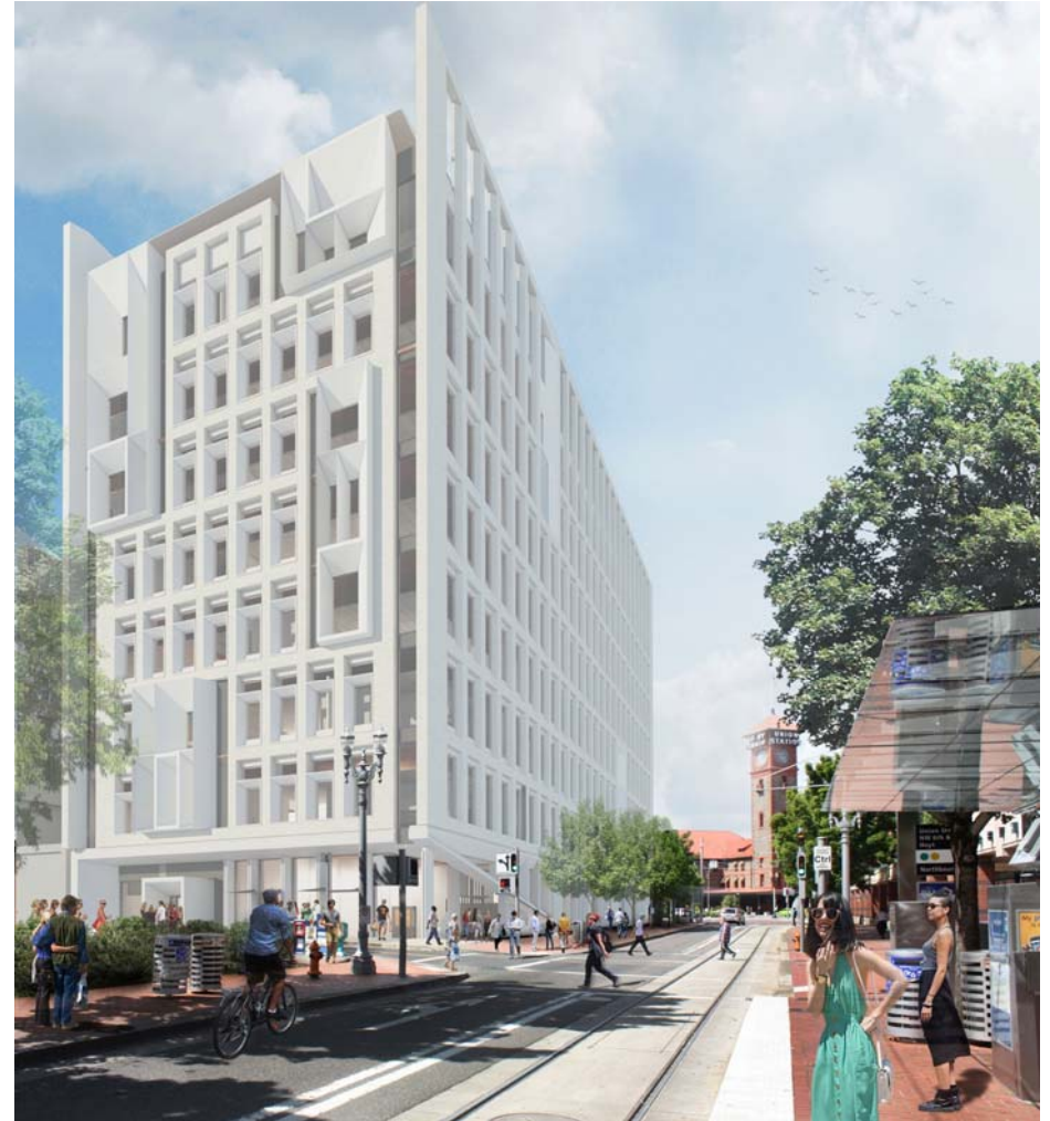
Gladys McCoy Building from 6 th Ave.