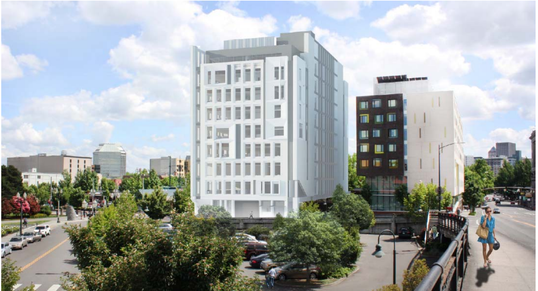
Gladys McCoy Building and Bud Clark Commons from Broadway Bridge