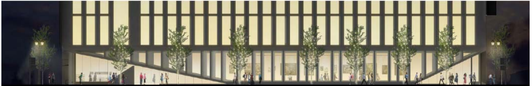
Night Rendering along NW 6th Ave.