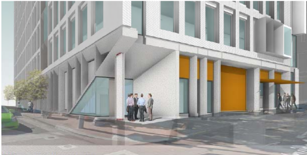
NW Irving Gallery Entry + Loading Dock