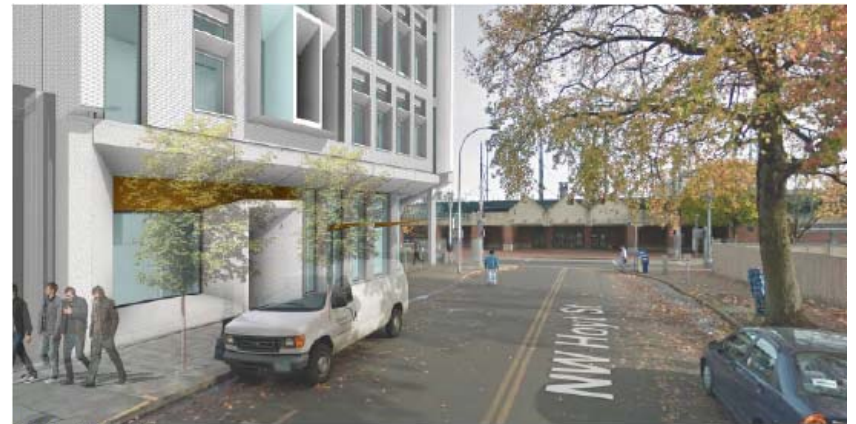
NW Hoyt Bike Entry