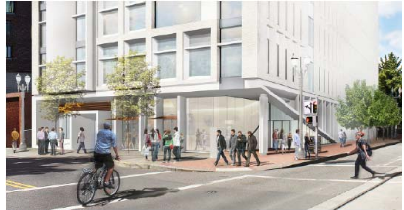
NW Hoyt Main Entry