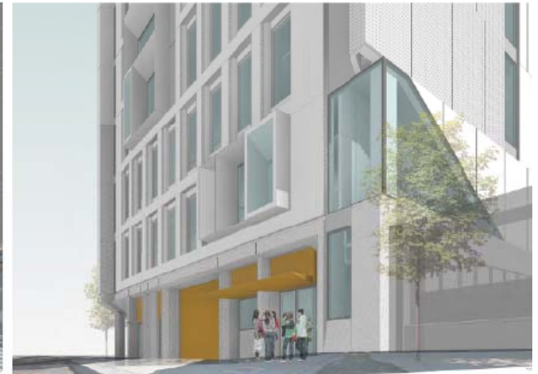
NW Irving Staff Entry and Loading + BCC Courtyard