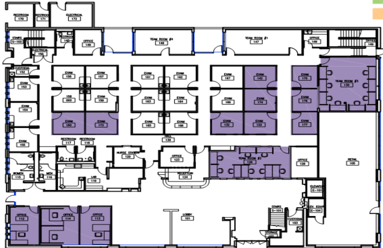
First Floor - SCHEME A.1