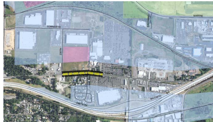
Sandy Blvd: 230 th -238 th Project