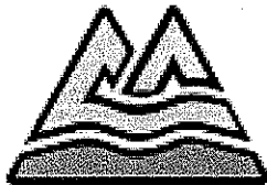
Exhibit C pages 1-5