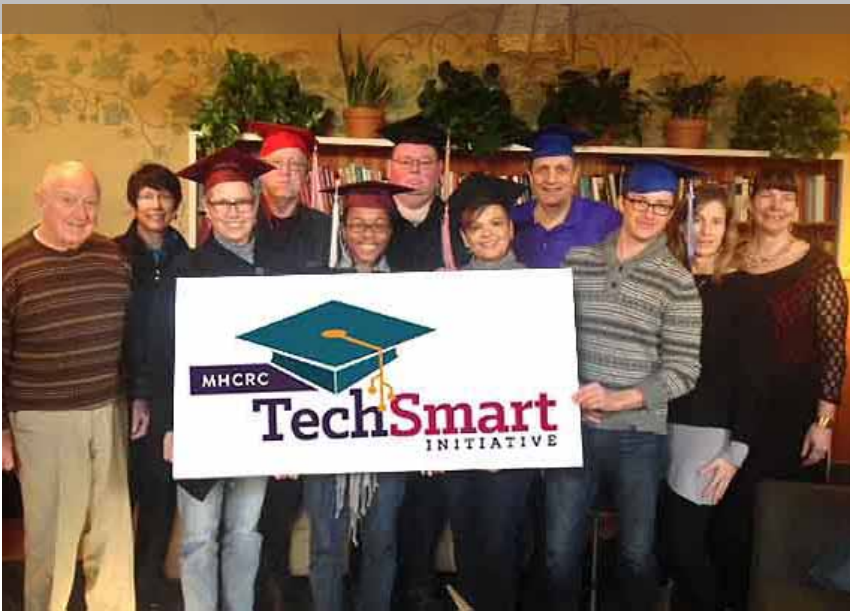
MHCRC commissioners and staff celebrated the launch of the TechSmart Initiative for Student Success in Fall 2015.