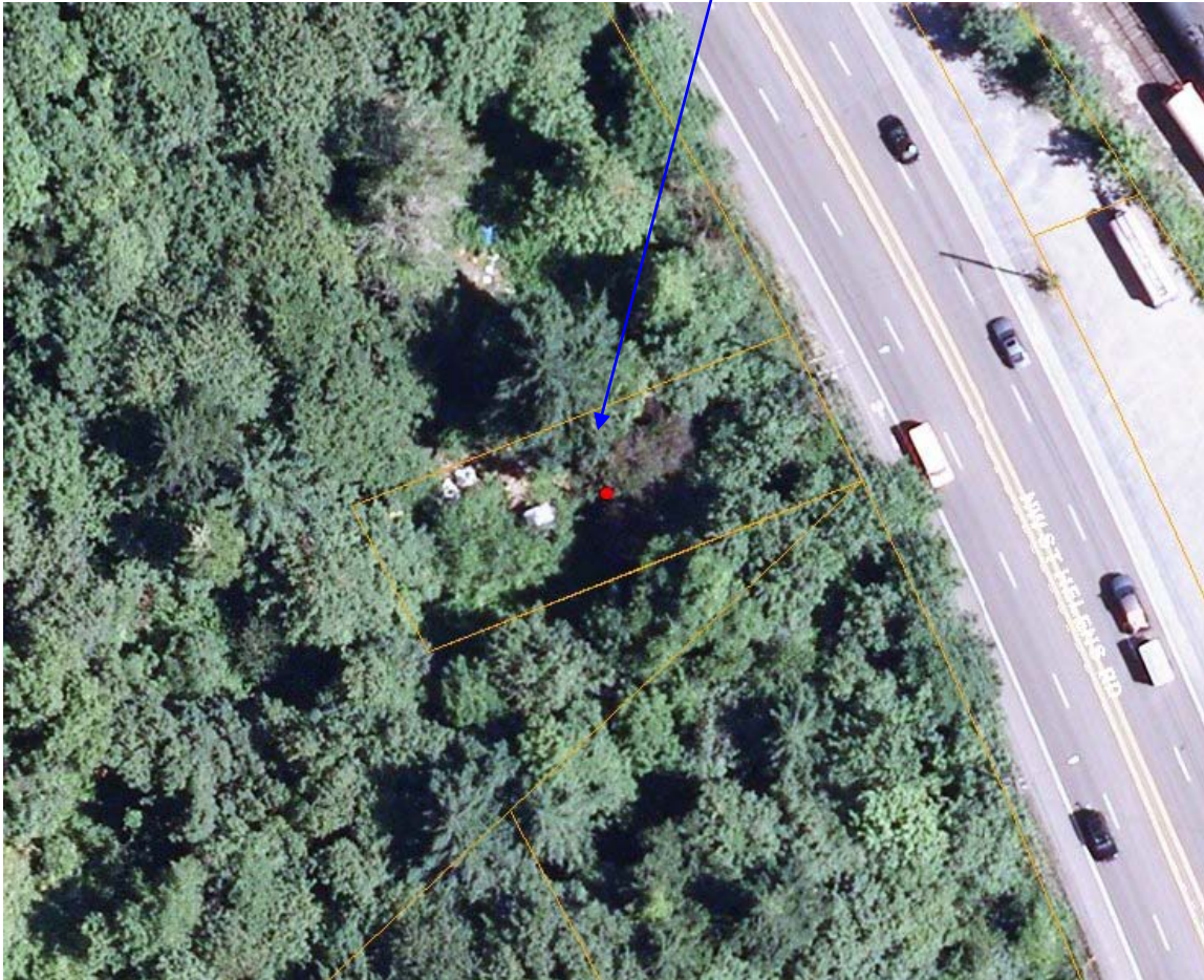
Exhibit B (APR)