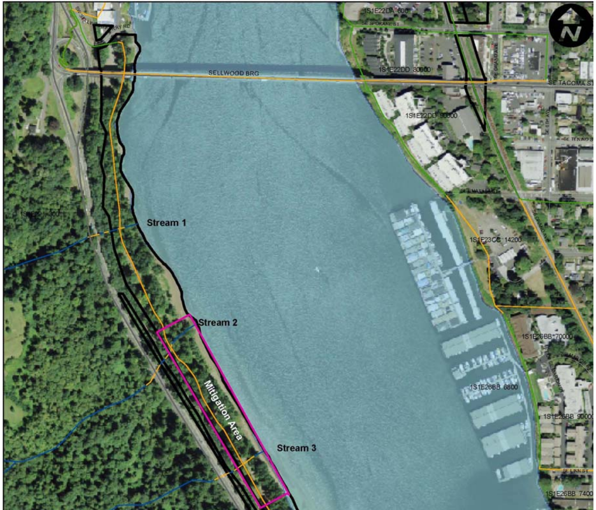
Attachment 2 POWERS MARINE PARK MITIGATION AREA