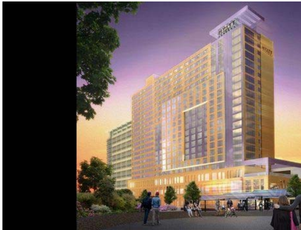
A May 2013 rendering of a proposed Hyatt Regency hotel at the Oregon Convention Center.

Print ( http://impact.oregonlive.com/front-porch/print.html?entry=/2013/09/convention_center_hotel_portla.html ) ( http://connect.oregonlive.com/staff/njus-e/index.html ) By Elliot Njus | enjus@oregonian.com ( http://connect.oregonlive.com/staff/njus-e/posts.html )