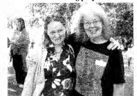
NorthStar members at NAMI/NorthStar Picnic