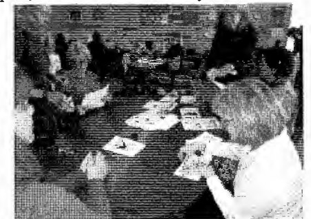
Members and volunteers working on fundraising project.

NAMI Multnomah founded NorthStar in 2010. NAMI Multnomah is the local affiliate of the National Alliance on Mental Illness, the nation's largest grassroots mental health organization. NAMI's mission is to improve the quality of life for adults living with mental health issues through support, education and advocacy.