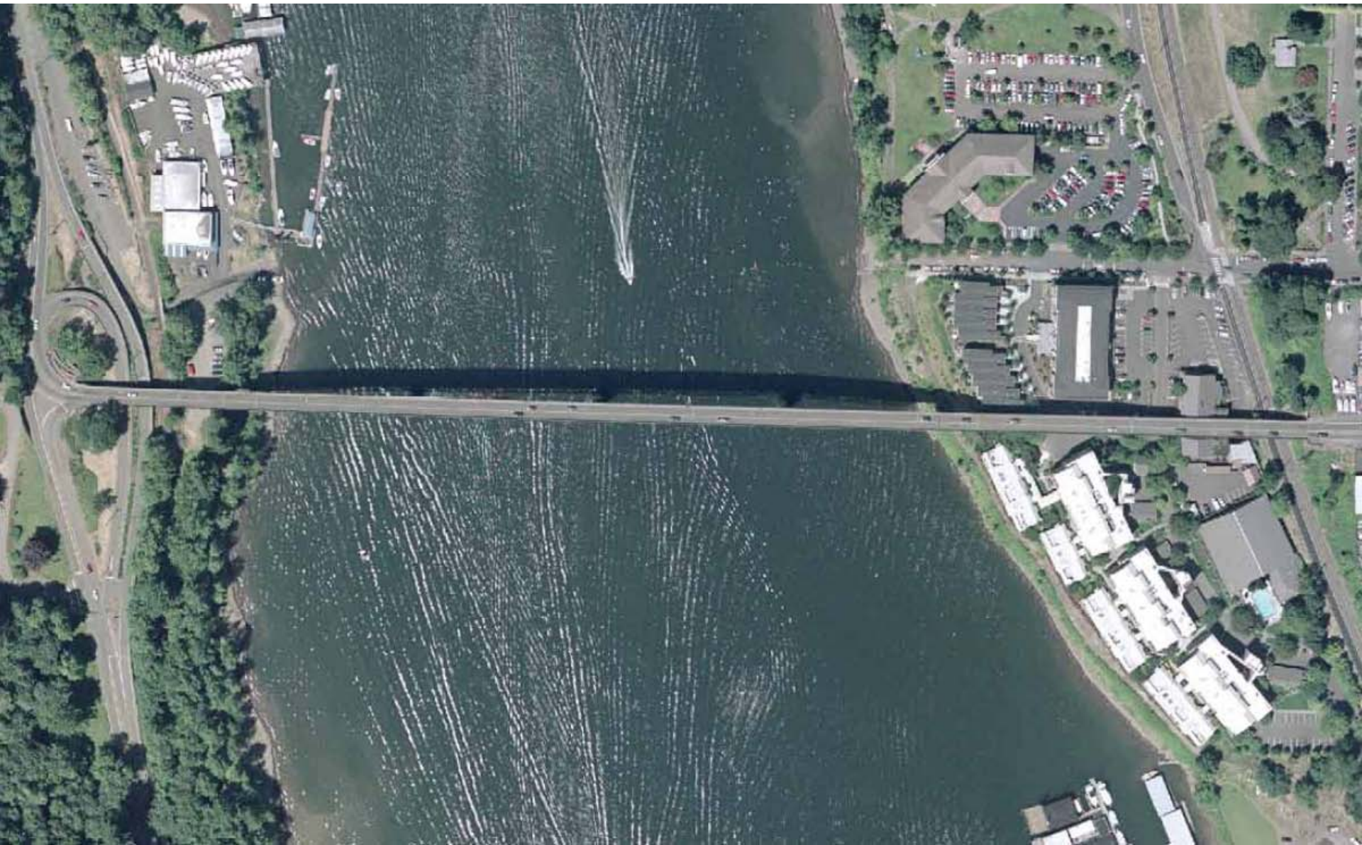
Existing Sellwood Bridge