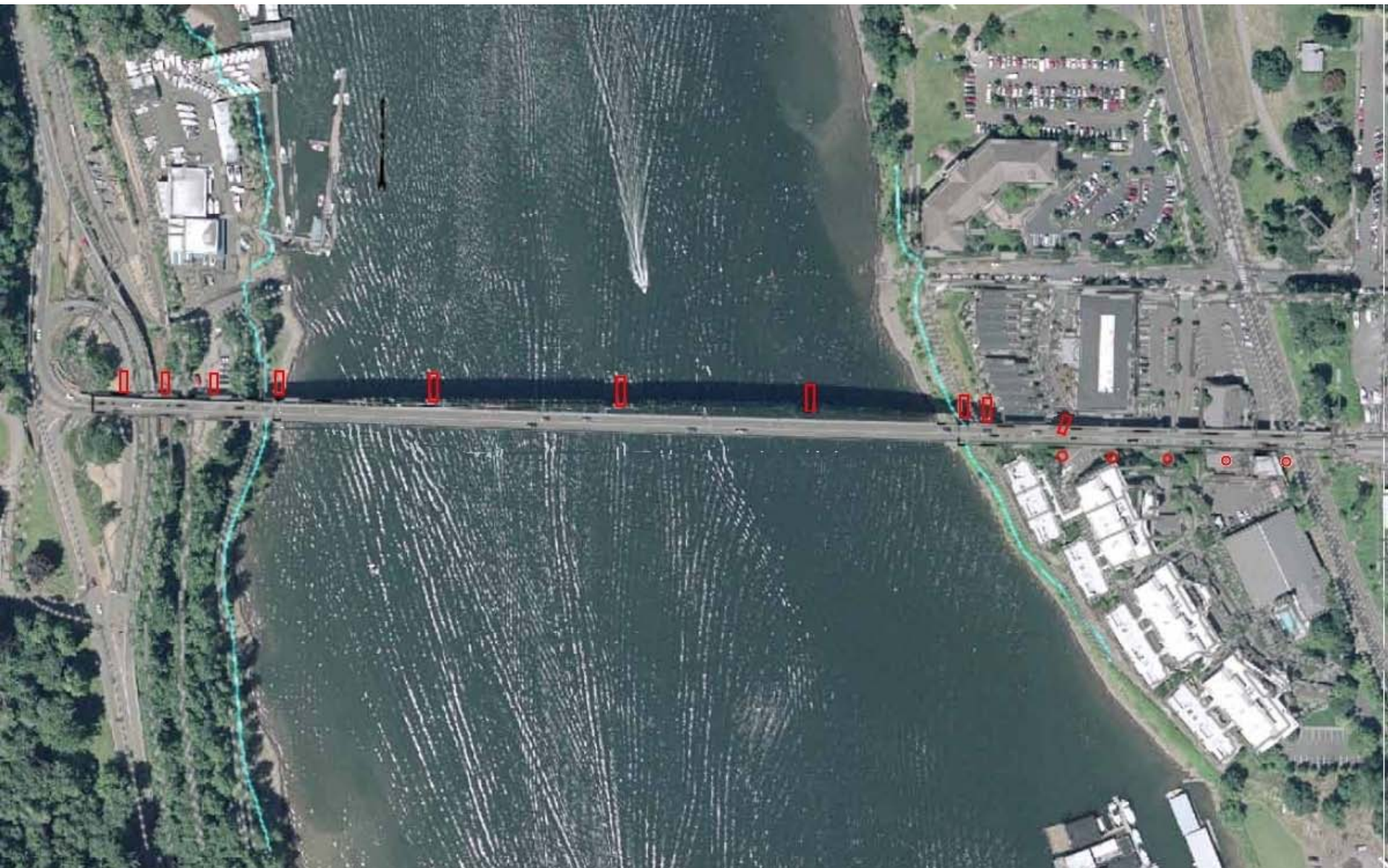
Temporary Foundations for Shoo-fly