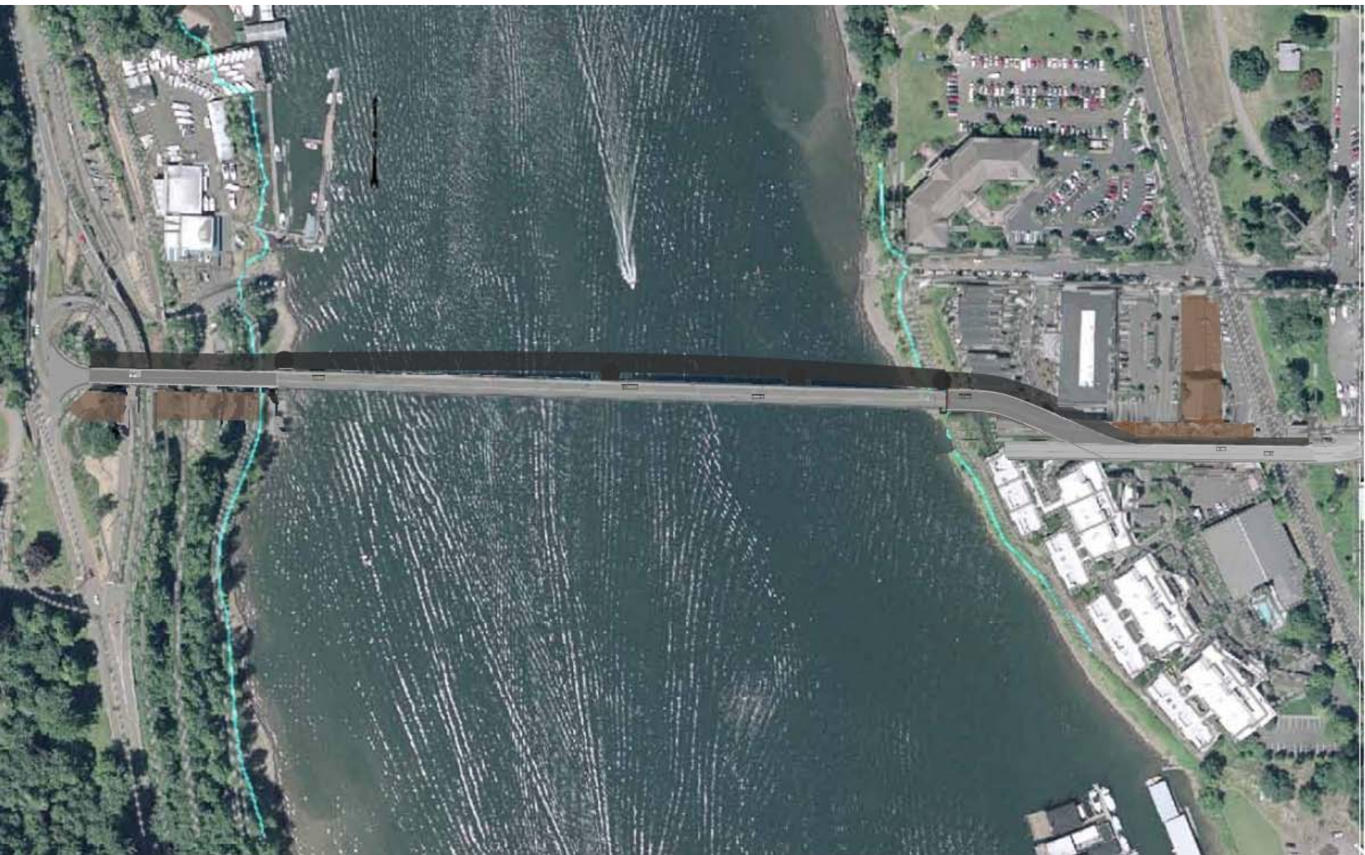
Open Temporary alignment to traffic