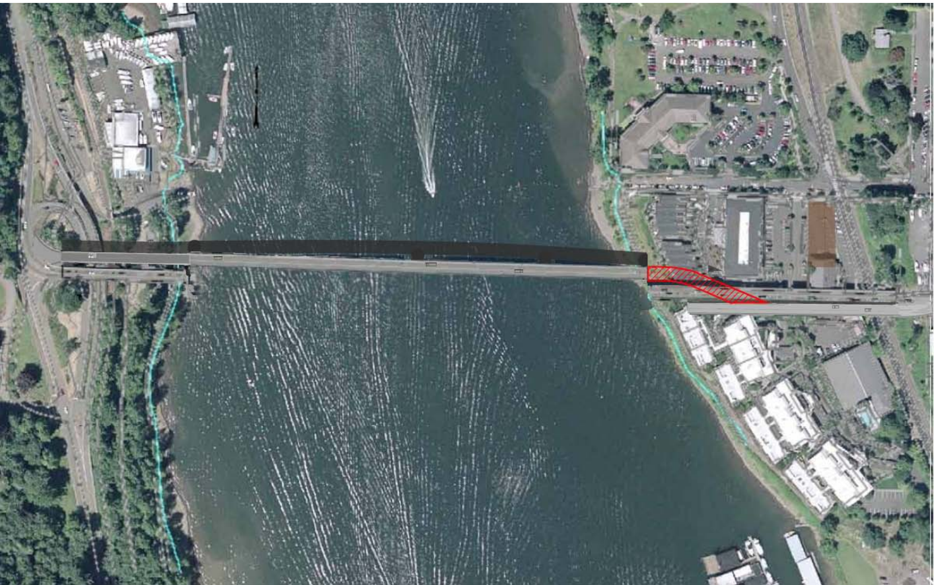
Slide Bridge spans to the North and construct temp connection, 1 month maximum closure