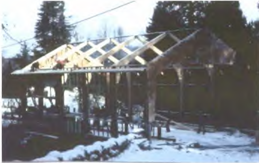
Only picture of construction work.