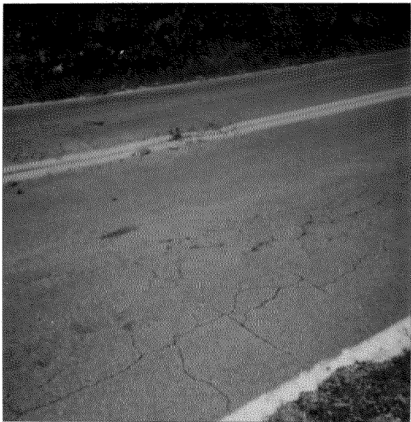
Pieces of road coming up on —centerline