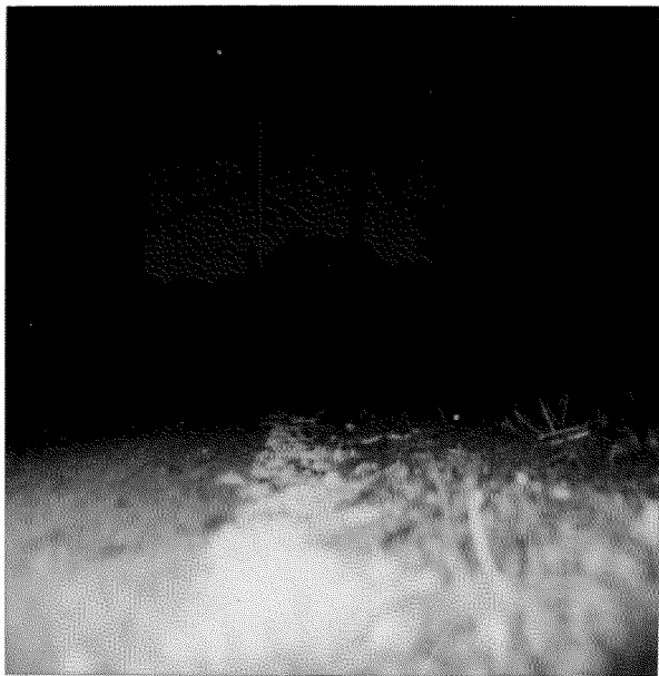
Shoulders higher than edge of road causing water to run down road