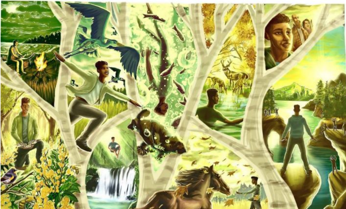
The Pursuit of Nostalgia, Damon Smyth